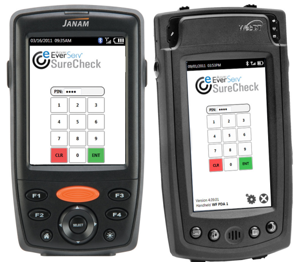
Mobile Device Options: Janam or WebDT

Minimal Up-front Costs – The SaaS model requires minimal capital expenditures compared to a client/server model.